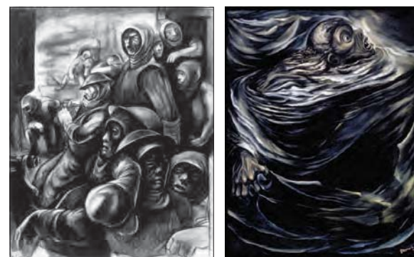
Left: Men on H.M.C.S. Iroquois at Action Stations Right: Drowning Sailor