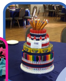
Example of a centrepiece.

Did you know? On average, JF&CS helps send 250 kids to camp.